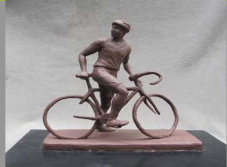
Maquette of the Bronze Sculpture to be placed in Cedar Creek Park

Near the entrance to the Wantagh State Bike Path from Cedar Creek Park, where the Sculpture will be placed.